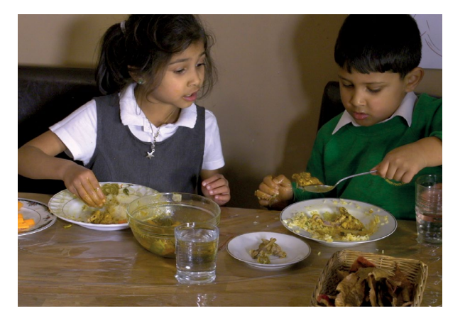
Charity number 1132581 | Company number 6952404